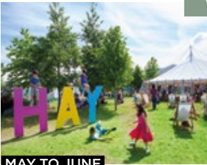
MAY TO JUNE

At Hay Festival you'll hear from the latest thought leaders spanning literary, political and philosophical fields. But it's a lot more fun than it sounds – comedy, music, food, pop-ups... and lots of bookshops. hayfestival.com