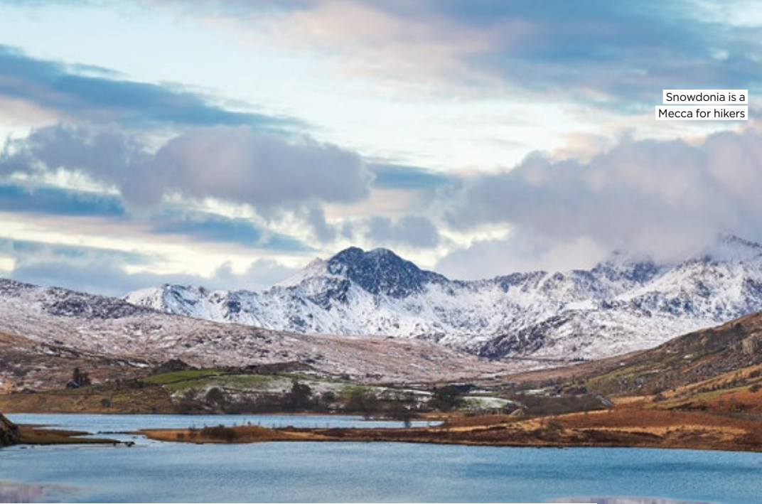
Snowdonia is a Mecca for hikers