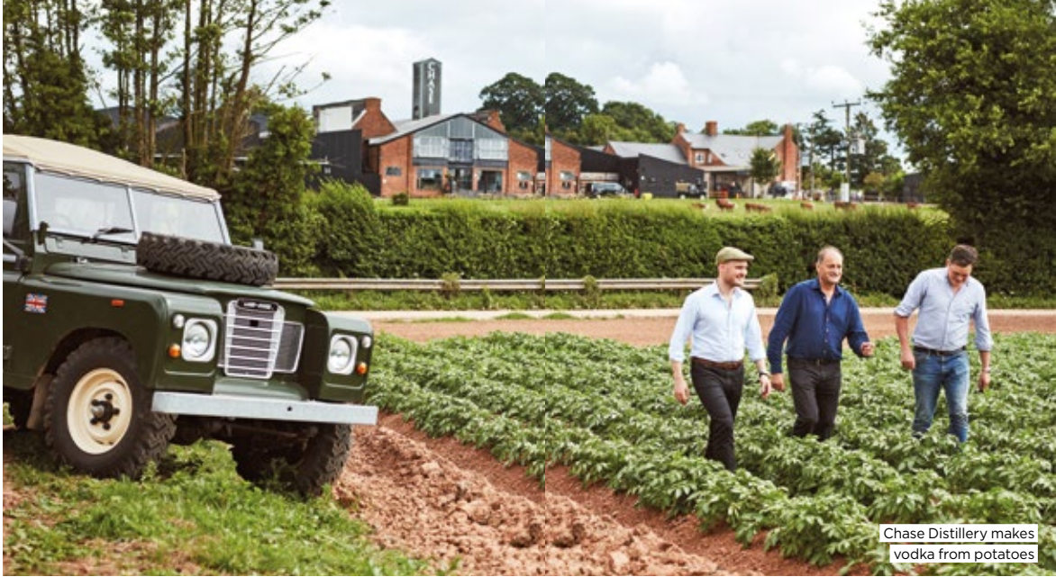
Chase Distillery makes vodka from potatoes

Take a tour of a single estate distillery with a twist. At Chase, just four miles out of Hereford, they make vodka and gin from potatoes. chasedistillery.co.uk Portmeirion is a slice of Italy in Snowdonia. Designed and built by Sir Clough Williams-Ellis between 1925 and 1975, it's now a holiday village but worth a visit to enjoy its stand-out toy town architecture (and an Italian gelato). portmeirion.wales