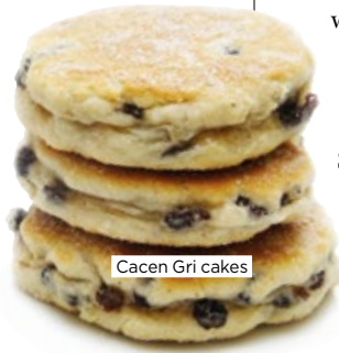
Caceni Gri cakes

Whether you're driving alongside the rolling coastline in Pembrokeshire, or from cultural Cardiff to the wild Brecon Beacons, or perhaps heading north to explore Anglesey, remember that the finest inns, shops and secret beaches are the ones you almost rolled right past.