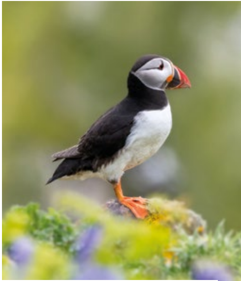
Skomer Island is puffin paradise

Thirteenth-century Conwy Castle is one of the most magnificent medieval fortifications in Britain. Tie in your visit with a day of shopping: sheltering behind its walls is a range of independent shops selling local crafts such as Welsh cloth, flannel and tapestries. The Potter's Gallery, also in Conwy, showcases the creative work of 20 regional craftspeople. cadw.gov.wales